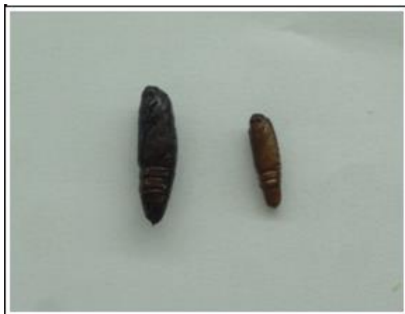
Fig. 2. Pupal abnormalities of S. littoralis after treatment of last instar larvae with the higher three doses of FMeV. Normal pupa (at left) and dwarf pupa (at right). These dwarf-sized pupae failed to metamorphose into adults.

Khafagi and Hegazi (1999) studied the latent effects of PI and PII on the wasp Microplitis rufiventris parasitizing on its host S. littoralis and recorded some larval-pupal intermediates in the wasp. Also, larval-pupal creatures were produced in S. mauritia after treatment with EMD (Balamani and Nair, 1989). In addition, the formation of larval-pupal intermediates was recorded in some insects as response to some precocenes (Khan and Kumar, 2000).