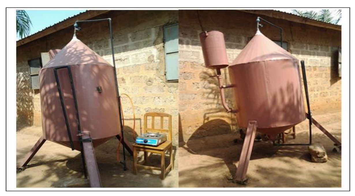
Fig. 1. Family metal digester.

compost. Indeed, the process of aerobic composting was disrupted by the great rainy season of May and June. During this period, the pile had to absorb much water by infiltration. However, compost should have a water content of 40 - 65% (Misra et al. , 2005). Too high humidity results in a drop in temperature within the pile, which prevents the destruction of pathogens. It should also be noted that the experiments were carried out with non-sterile equipment in a microbiologically uncontrolled working environment, thus considering these working conditions as a potential source of contamination of the final products.