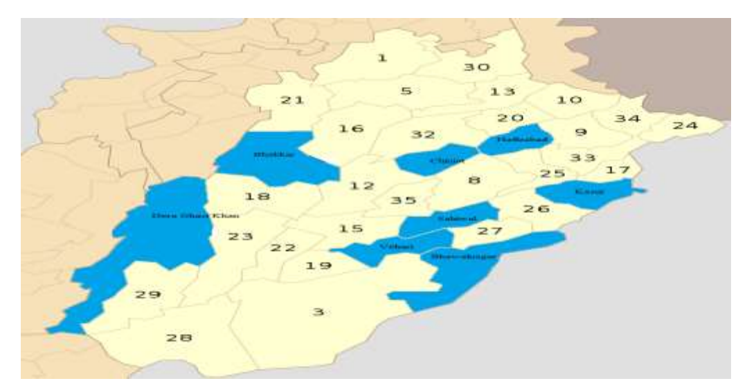
Fig. 1. Map of Punjab province showing the selected study areas.

As shown in Fig.1, Punjab province has 36 districts. The study areas are Bhakkar, Bhawalnagar, Chiniot, D.G. Khan, Hafizabad, Kasur, Sahiwal and Vehari districts. The land of Punjab province mostly contains of productive alluvial plains. It is the part of Indus valley, fed by Indus River and its four major tributaries in Pakistan, the Jhelum, Chenab, Ravi, and Sutlej rivers. Most areas of Punjab observe harsh extremities in weather with fog in winters, frequently accompanied by rain. From the mid of February, the temperature begins to rise, spring season weather continues until mid-April. Punjab's region temperature averagely ranges from -2° to 45°C, but can reach 50°C (122°F) in summer and -10°C in winter. Cotton, wheat, rice, gram, sugarcane and citrus are the major crop grown in the area. Water losses are more and tremendous effort are required to develop the route of watercourse, such that the losses could be reduced to minimum.