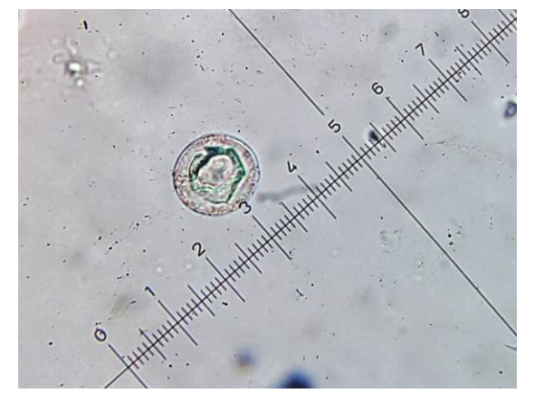
Fig. 5. Hymenolepis nana egg, direct from water, 40X.