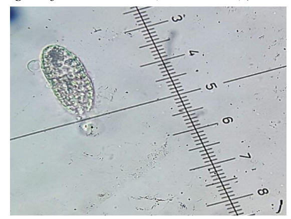
Fig. 12. Coleps hirtus ciliate, direct from water, 40X.