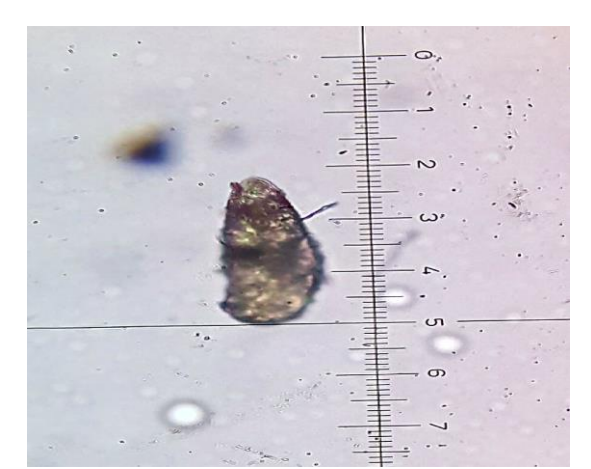
Fig. 11. Nyctotherus ovalis ciliate, direct from water, 40X.