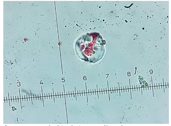
Fig. 8. Entamoeba histolytica cyst, direct from water, 40X.