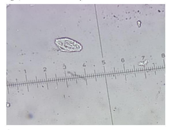
Fig. 10. Balantidium coli cilia, direct from water, 40X.