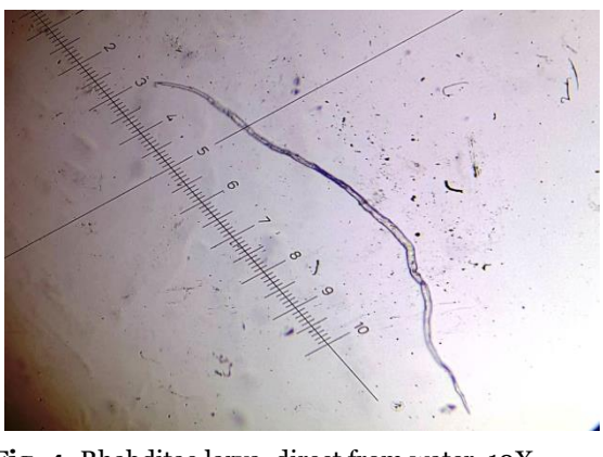
Fig. 4. Rhabditae larva, direct from water, 10X.