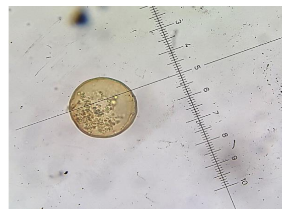
Fig. 9. Entamoeba coli cyst, direct from water, 40X.