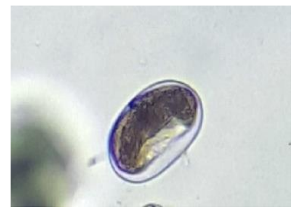
Fig. 3. Strongyloides sp. egg direct from water, 40X.