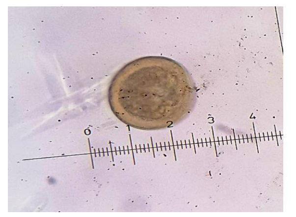
Fig. 2. Toxocara canis egg, direct from water, 40X.