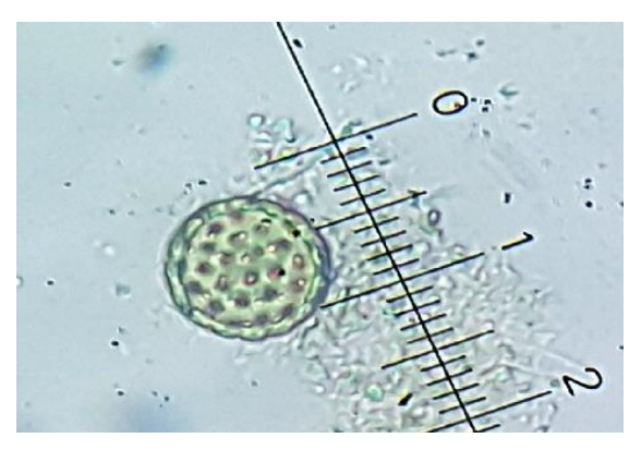
Fig. 1. Ascaris lumbricoides egg, direct from water, 40X.

*Significant difference among studied areas p< 0.01.