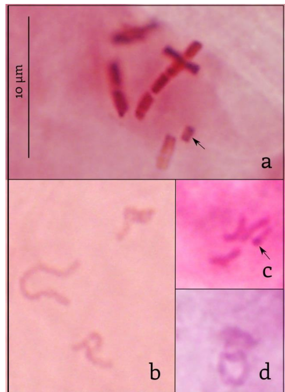
Fig. 3. a-d. Mitosis. a. Metaphase with 8 chromosomes. b. Prometaphase with 4 chromosomes. c. Metaphase with 4 chromosomes. d. Anaphase with 4 chromosomes each pole. The arrow mark the possible B-chromosome. Bar 10µm.

The presence of a monovalent of irregular behavior in mitosis and the presence of the heteropynotic punctate body positive is described for the first time; however, in the work by Adamson and Nasher (1987) that corpuscle is observed in the images of Fig. 3, 9, 10 and 12 of their publication, without the author making reference to it.