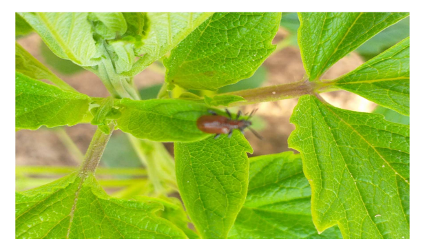
Plate 2. Sesame flea beetle, A. bimaculata foraging feeding on sesame leaves and stems in the field.

Each value is a mean \pm standard error of five treatments, *, **, and *** significant at p \le 0.05 , p \le 0.01 and p \le 0.001 respectively and ns means not significant. Means within the same column followed by the same letter (s) are not significantly differently at p = 0.05 from each other using Fishers Least Significant Difference (LSD) test; Tv means T vogelii , Ru means rabbit urine and Sp means synthetic pesticide (Duduba 450 EC).