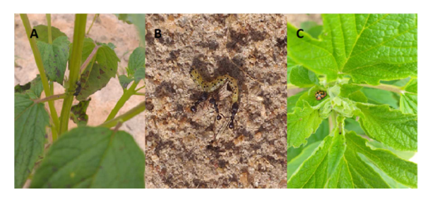
Plate 3. A: T. sessile foraging for prey A. catalaunalis larva on sesame plant crop and B: T. sessile feed on a fallen down A. catalaunalis larva. C: C. undecimpunctata foraging for prey A. catalaunalis larva on sesame plant.

These natural enemies together enhanced the reduction of the population of the A. catalaunalis and finally reduced the damage of S. indicum in the field.