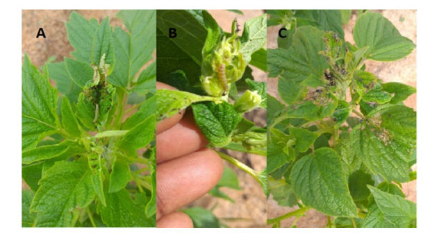
Plate 1. A: Sesame webworm A. catalaunalis on sesame plant before flowering period, B: Sesame webworm A. catalaunalis on sesame plant during flowering period and C: Sesame plant damage caused by the A. catalaunalis .

Each value is a mean \pm standard error of five replicates, *, **, and *** significant at p \le 0.05 , p \le 0.01 and p \le 0.001 respectively and ns means not significant. Means within the same column followed by the same letter (s) are not significantly differently at p = 0.05 from each other using Fishers Least Significant Difference (LSD) test; Tv means T vogelii , Ru means rabbit urine and Sp means synthetic pesticide (Duduba 450 EC).