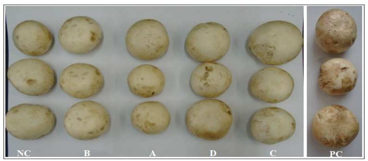
Fig. 3. Screening Bacteria for Antagonism on mushroom fresh caps. NC: Negative Control, PC: Positive Control (inoculated with p.tolaasii only), A-D selected antagonists.

repetitions. For effective biological control of P. tolaasii , application of Pseudomonas spp. and kocuria sp. suspensions with pathogen, simultaneously, will provide adequate control (Fig.3).