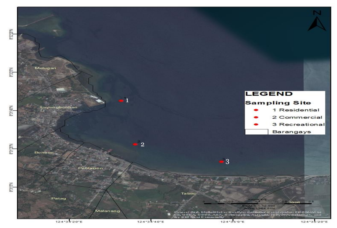
Fig. 1. Map of Opol, Misamis oriental.

Fig. 1 below shows the map of Opol, Misamis Oriental wherein three (3) sampling stations were established. Sampling site1 is located in Barangay Luyong Bonbon, near a company distributor, categorized as residential area. The second site is located in Barangay Poblacion, where establishments such as restaurants, public market and more are located which makes the area as commercial. And sampling station 3 is located in Barangay Taboc, which is situated along several beach resorts or recreational area.