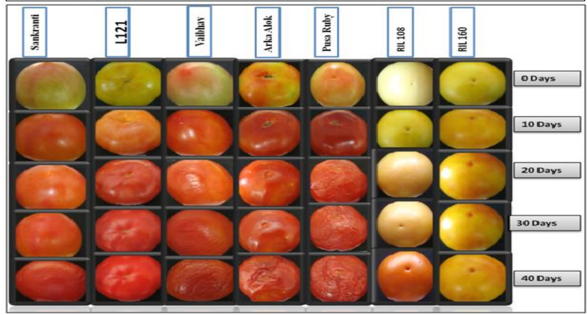
Fig. 3. Five lines with two testers for high shelf-life at different post-harvest stages.

1-Sankranti, 2-Pusa Ruby, 3- Vaibhav, 4- Arka Alok, 5- L121, T1- RIL-160, T2- RIL-108, 1F1- Sankranti x RIL160, 2F1- Sankranti x RIL-108, 3F1- Pusa Ruby x RIL-160, 4F1- Pusa Ruby x RIL-108, 5F1- Vaibhav x RIL-160, 6 F1- Vaibhav x RIL-108, 7F1-Arka Alok x RIL-160, 8F1-Arka Alok x RIL-108, 9F1- L121 X RIL-160 and 10 F1- L121 X RIL-108