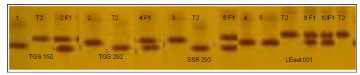
Fig. 2. PAGE gel profile of five hybrids along with five parents and tester 2.

For total yield only cross, L121 × RIL-108 has recorded significantly higher yield compared to standard check1. For single fruit weight cross Sankranti × RIL-160 and cross L121 × RIL108