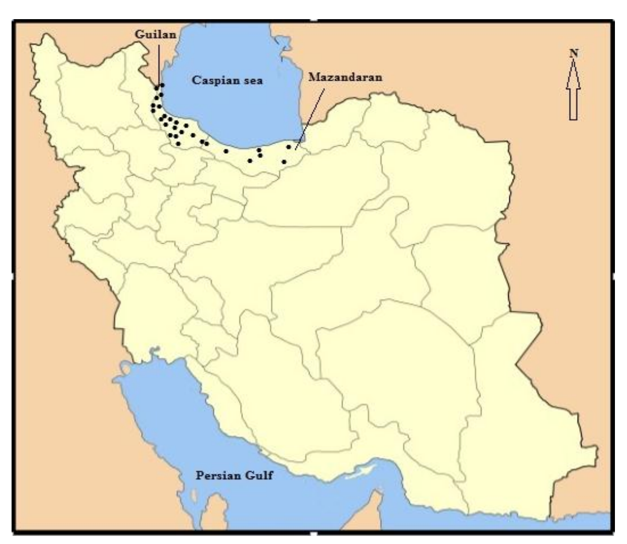
Fig. 1. Rubus sampling localities in N Iran.