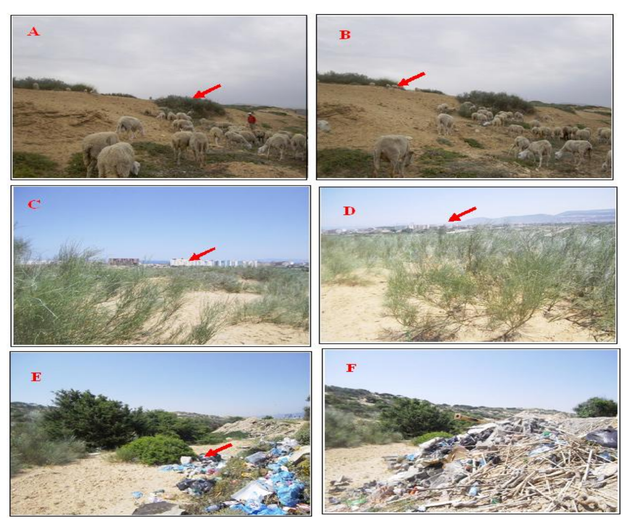
Pl. 1. Factors of degradation of the housing environment of Retama monosperma.

The Mediterranean-Atlantic element (Méd-Atlant). With o2 species with a 18.18 % presence, the western Mediterranean element (Méd-Occid).; Euro-Mediterranean (Euro-Méd). And Eurasian (Euro-Asi) with o1 species for each of them, is a 09.09 % presence.