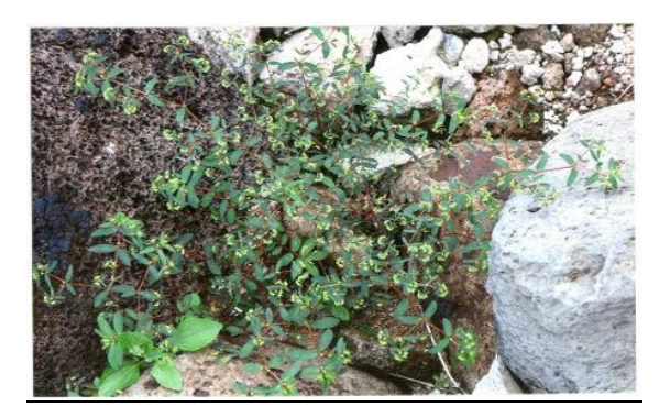
Fig. 2. Euphorbia golondrina L. C. Wheeler, whole plant ,growing on rocky-ground with dense branching at Afala hill in Wabane Municipality of the Mt Bambouto Caldera, Western Cameroon in July 2014.