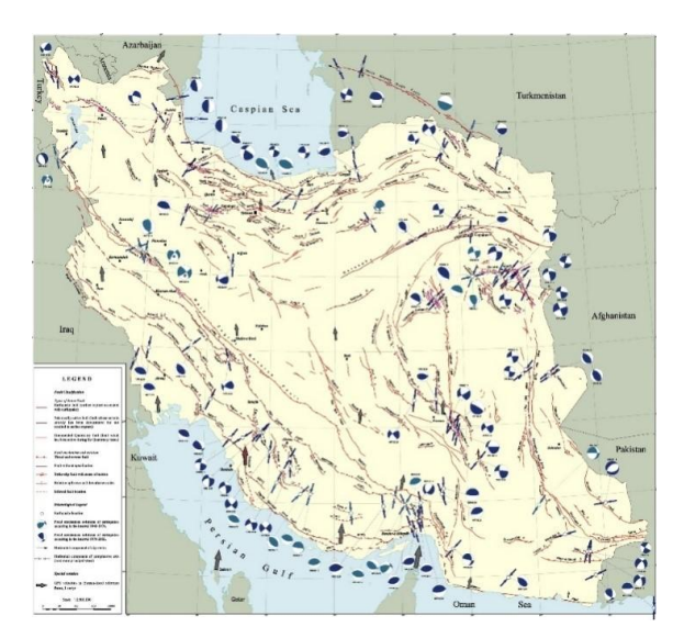
Fig. 2. The map of active faults of Iran.