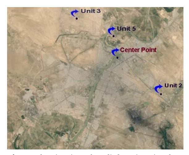
Fig. 1. The situation of studied stations in Ahvaz metropolitan city.

Concerning the classification done based on the geographical situation of station, operational stations that are located in Ahvaz and its surrounding areas are subcategory of Karoon oil and gas Utilization Company and among these stations, Ahvaz 2, Ahvaz 3 and Ahvaz 5 stations have inevitably located in neighborhood of residential areas after development of residential areas of Ahvaz. Fig.1 shows the situation of stations and their neighborhood with residential areas in Ahvaz.