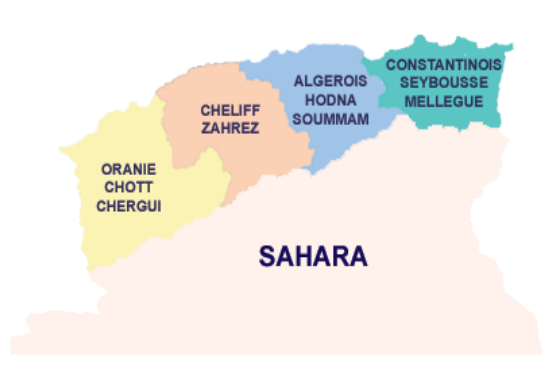
Fig 2. Map of the five regions of hydraulic planning (EMWIS, 2014).

The country is divided into five hydrographical watersheds gathering the 19 watersheds in the country (Fig 2) (AQUASTAT, 2005). Except few coastal streams, the only river in Algeria is that of Cheliff (725km) which derives its source from the Tellian Atlas and flows into the Mediterranean. There is no permanent river in the south of the Tell region. The lakes that spread over the desert regions are temporary ones, salty most of the time (Chott Chergui, Chott el Hodna) (Haddad and Rahla, 2004).