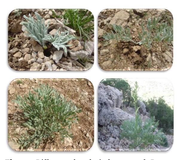
Fig. 2. Different phenological states of Dorema aucheri.

D. aucheri is a perennial plant with thick stems, as tall as 180 to 250 cm, glabrous, purple-in-Groove, the upper part of the panicle branches, leaves with little tomentous, canopy of branch with a pedicle (Mozaffarian, 2007). This plant grows well in subhumid to humid climate, with a mean annual rainfall of 750-850 mm. Under the favorable conditions, and according to the elevation, the seed begins to germinate in late March until mid-April (Kazemi et al., 2010; Mirinejad, 2011). Various members of Dorema, are effective antispasmodic, expectorant diuretic, carminative, diaphoretic, vasodilator, (Azarnioushan et al., 2009; Ghollassi, 2008; Yousefzadi, 2011a), antimicrobial and antifungal (Mokhtari et al., 2008b; Shahidi & Moein 2002; Yousefzadi, 2011b), hepatoprotector (Govind, 2011; Mokhtari et al., 2008b) and are intensively used as a green vegetable or as a popular medicine for treatment of many human diseases (Ibadullayeva, 2011). According to the popular believes among Armenians and Azeri, D. glabrum can cure many diseases especially different kinds of cancer. It seems that extensive use of this plant for medicinal and domestic purposes is the major cause of dramatic reduction in the natural resources of D. glabrum (Gabrielian, 1981; badullayeva et al., 2011). In addition to the crude extract of the plant that demonstrated antioxidant activity and anti-lipidemic effects (Dehghan et al., 2009; Sadeghi, 2007), the resin that