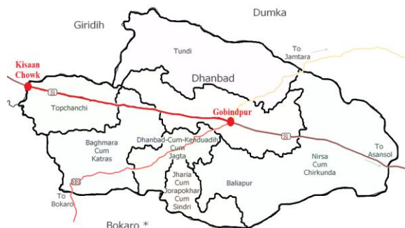
Fig.1. Study area map of dhanbad district, NH-2 highway (Kisaan chowk to Gobindpur).

national highway differed from the site-A and site-B. The vegetation was very rich in both sides, but site-B (Gobinpur to Kisaan Chowk) was very rich Comair to Site- A (Kisaan Chowk to Gobindpur).