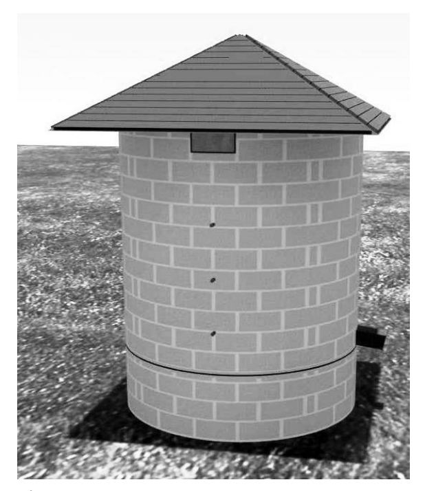
Fig. 2. Three dimensional view of the concrete block grain storage bin.

Three openings were made on top, middle and bottom of the wall using PVC pipes for monitoring of stored grain and covered them to prevent stored grain from insect and atmospheric effect. Grain channel and outlet facilities were given at the top and lowest