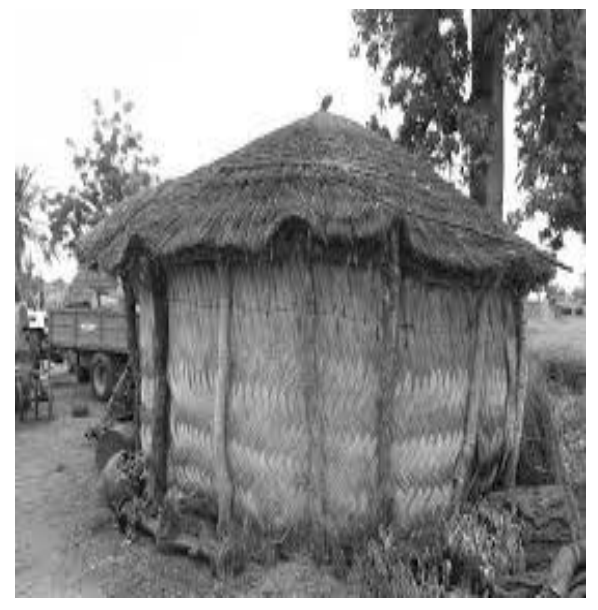
Fig. 3. Wheat grain stored in bamboo/straw bin.

Bamboo/straw bin: This structure is made of date palm leaves or woven straw tangle and wooden/ bamboo log of variable sizes and shapes. The base on which the structure is built is made up of blocks or stones 2-3 feet over the ground level. Straw tangles and covering are settled on the wooden skeleton utilizing ropes. The highest point (top) of the structure is secured with straw tangle and covering and eventually these structures are coated with mud to make them airtight. Grain is filled in bulk through an entryway provided at the top of wall of the structure and the same opening is utilized as an outlet for grain (Fig. 3).