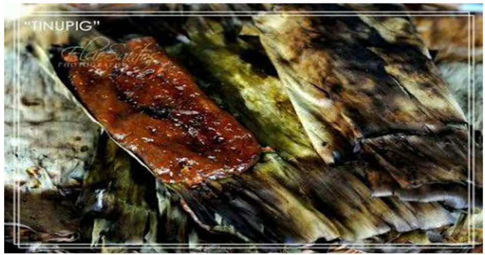
Fig. 1. Original packaging of Tinupig.

Fig. 1 shows the original packaging of Tinupig, which is only wrapped in banana leaves and placed inside a used juice drink (Funchum, Zest-O,