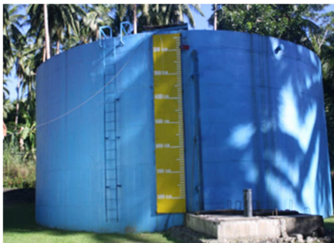
Fig. 3. Reservoir

Untreated water samples collected through faucet cover changes in physicochemical properties that happened during water transit from surface water down to the collapsible dam before the raw water reached the collection box. These changes might have affected the quality of water being treated. In the same sense, the researcher collected samples of treated water at the reservoirs' outlet faucet to limit the changes in physicochemical properties that might happen during water distribution.