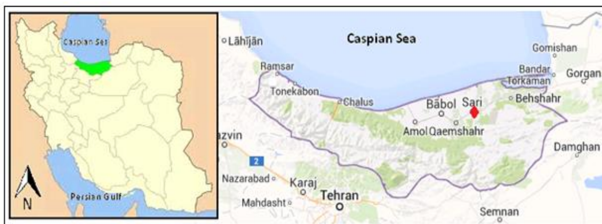
Fig. 1. Map of Iran, showing location of Mazandaran province and Sari city.

To perform this research, it was used two years old plant of Mentha Piperita in the farm located in Niala of Galugah in 2013 (Figure 1). Experiments with a randomized block design with eight treatments by shade, sun, oven (50°C and 70°C) and microwave (100 W, 300 W, 600 W and 900 W) established with three replications in university of agricultural sciences located in Sari. (Table 1).