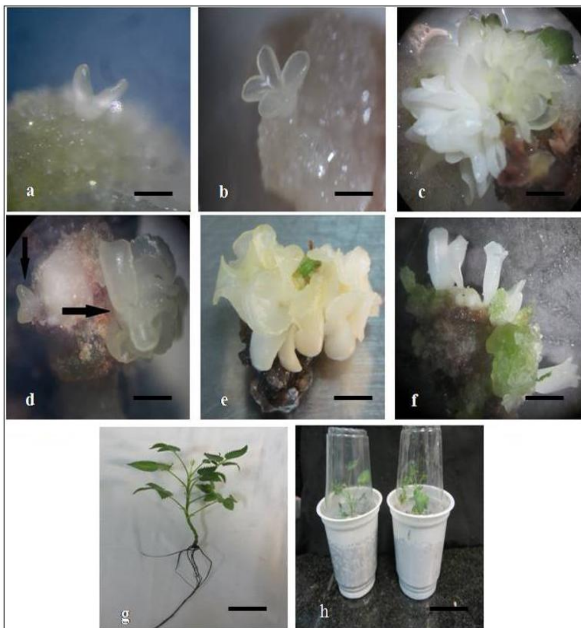
Fig. 1. Somatic embryogenesis, secondary somatic embryogenesis and plant development in Rosa hybrida . a–b: Primary somatic embryos (bar = 0.5 mm); c: Secondary somatic embryos of 'Full house' from the calli cultured on MS medium supplemented with 0.5 \text{ mg l}^{-1} 2, 4-D (bar = 1 mm); d: Primary somatic embryos at the heart shape and cotyledonary stages (bar= 1 mm); e: Secondary somatic embryogenesis in 'Ocean song' from the calli cultured on MS medium supplemented with 3 \text{ mg l}^{-1} NAA (bar = 2 mm); f: Elongation of cotyledons in embryos of 'Ocean song' (bar = 2 mm); g: Plantlet regenerated from somatic embryos in 'Ocean song' (bar= 3cm); h: Green house acclimated plants regenerated from somatic embryos in 'Ocean song' (bar= 4cm).

In experiment 3, the highest frequency of embryogenesis (46.66%) was observed in 'Ocean song', when the induction culture medium was supplemented with NAA ( 3 \text{ mg l}^{-1} ) and proline ( 300 \text{ mg l}^{-1} ) (Table 3). However, this medium did not